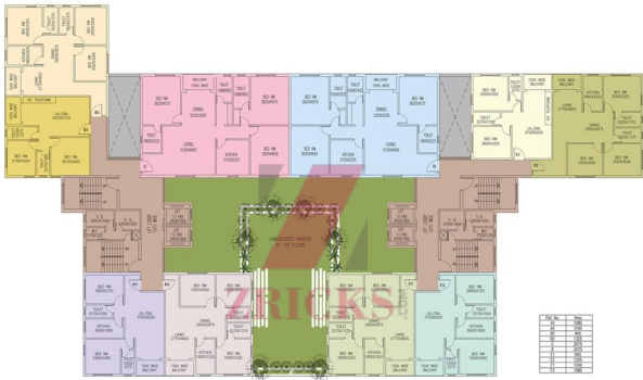
BLOCK-3 TYPICAL FLOOR PLAN (2ND,5TH,8TH & 11TH FLOOR)