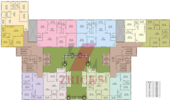
BLOCK-3 TYPICAL FLOOR PLAN (4TH, 7TH & 10TH FLOOR)